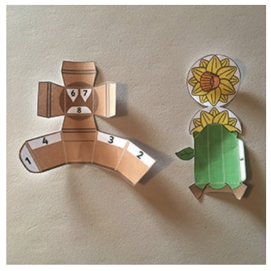
Step 1. Carefully cut around all the shapes for the Daffodil following the solid black line.