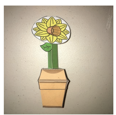
Your completed daffodil will look like this.

Assemble the daffodil by gluing the flower to the corresponding tabs 6,7 and 8.