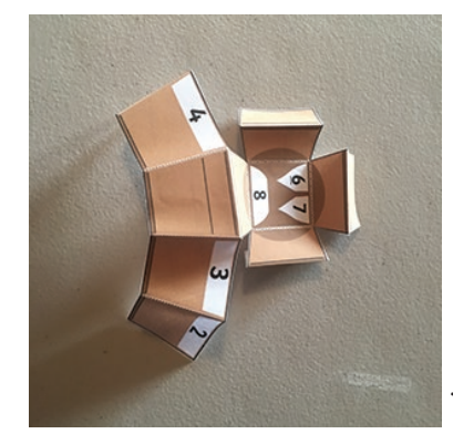
Step 2. Starting with the pot shape, fold along the lines following the fold quide.