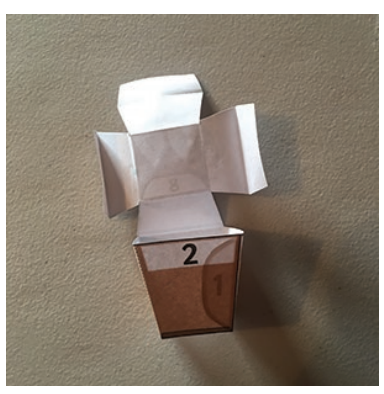
Step 3 Glue the 1 tab to the side to form the pot.