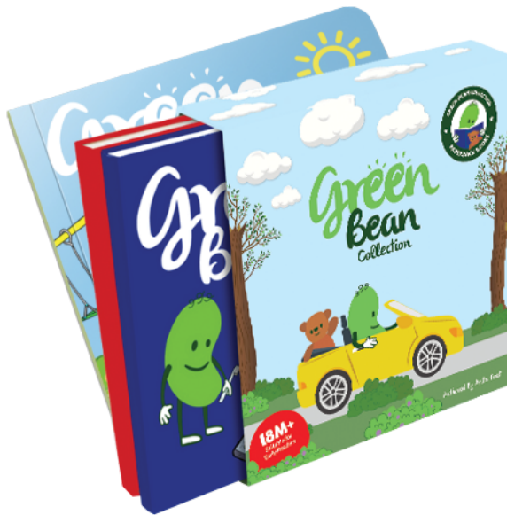
Paperback Book Boxset