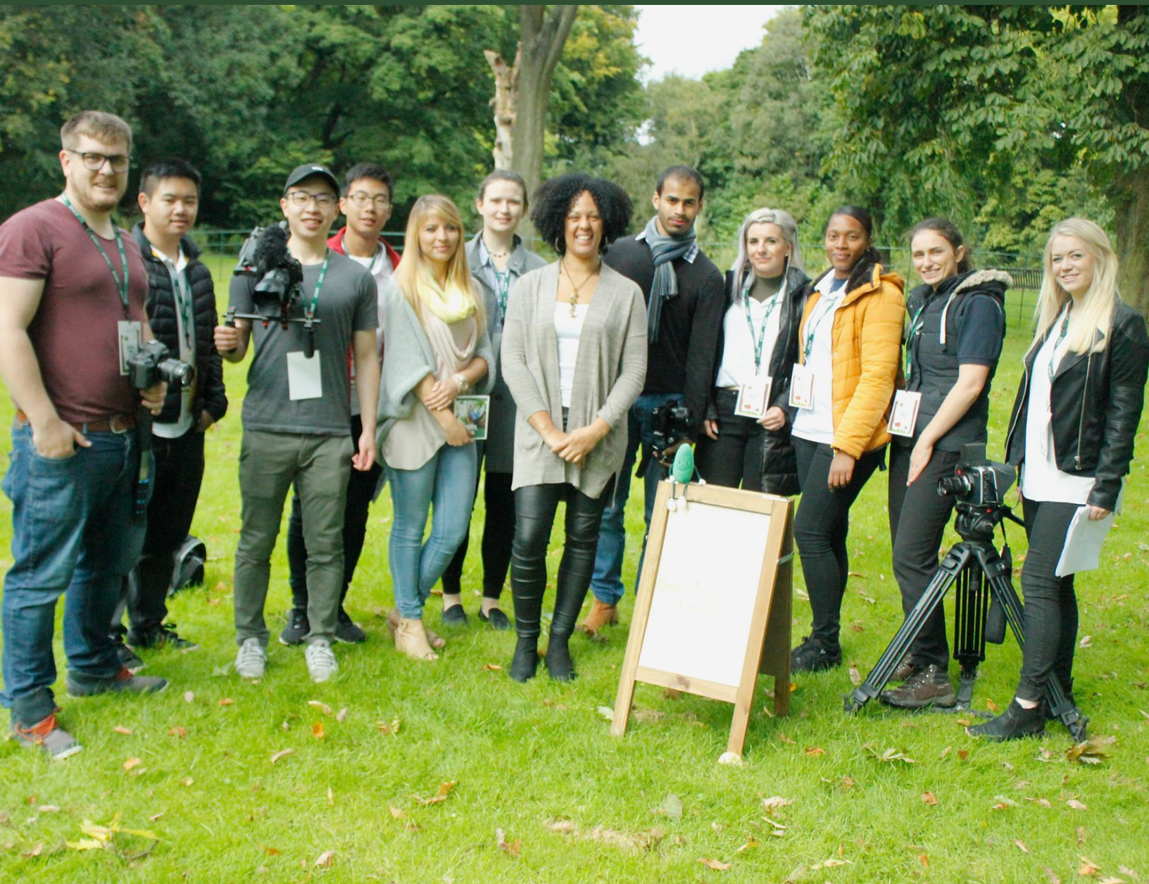
Above: Team Photo 2017