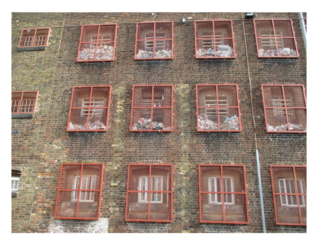
Rubbish in window grills