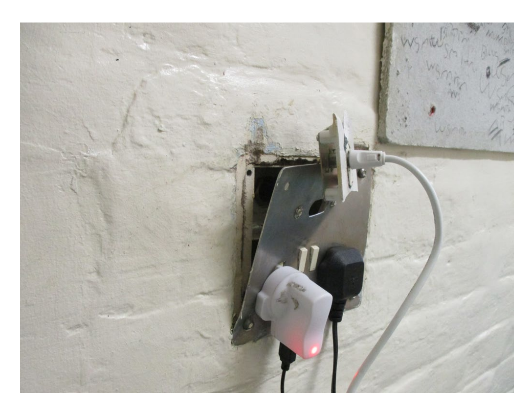
Loose electrical fitting

4.7 Despite work to control the issue, there was still a significant problem with rats, including on wings and in food servery areas. Although efforts were made to clean outside areas, rubbish had accumulated on flatroofed areas outside wings and in some cell window grilles.