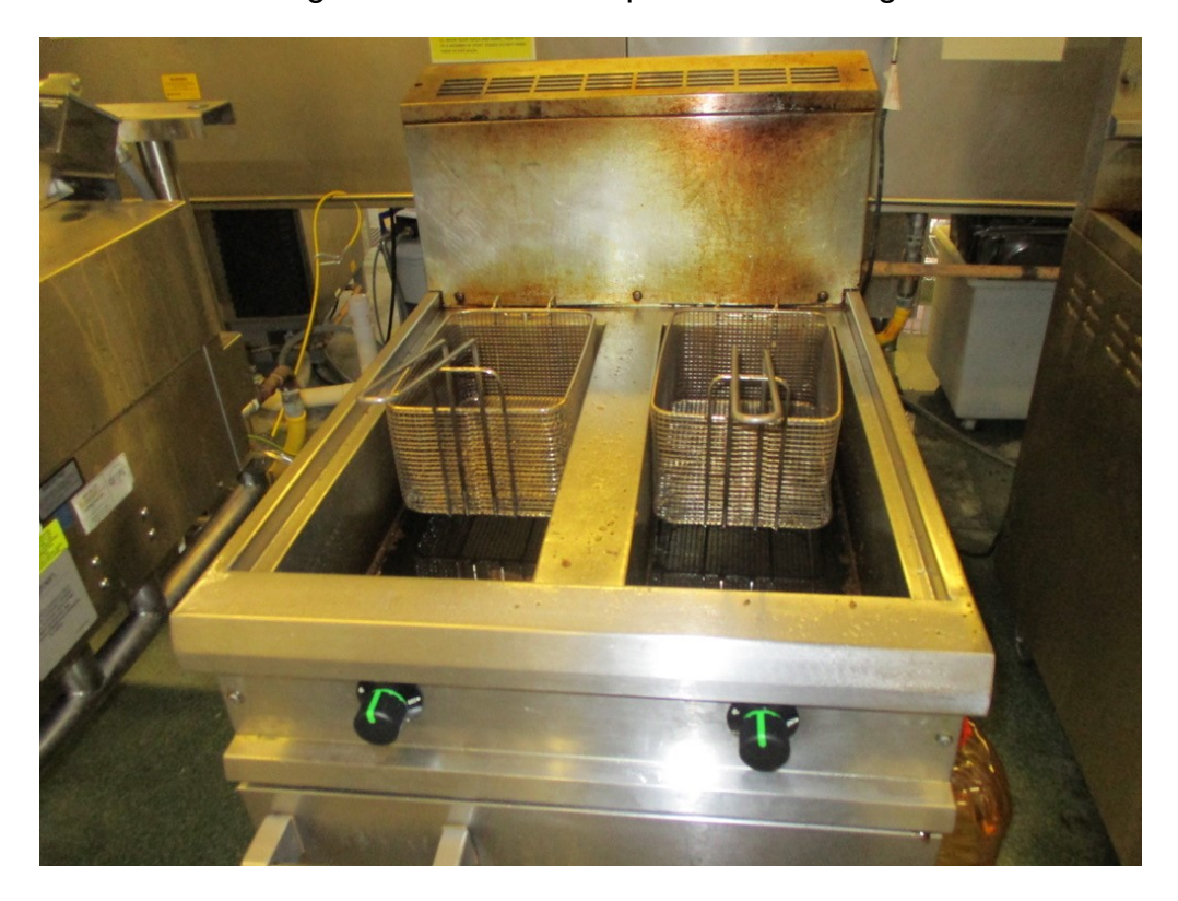
A dirty fryer in the kitchen

4.12 The main kitchen was unkempt and grubby. Several items of equipment were in poor repair and had been out of order for a long time. Poor drainage meant that water pooled in cooking areas.