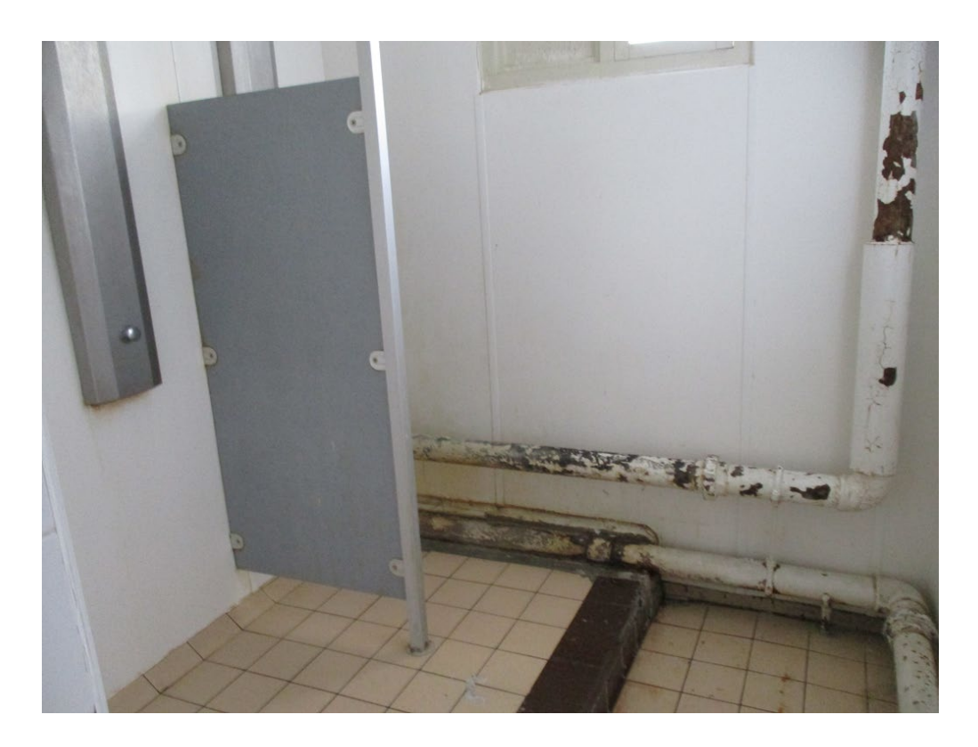
Condition of C wing showers