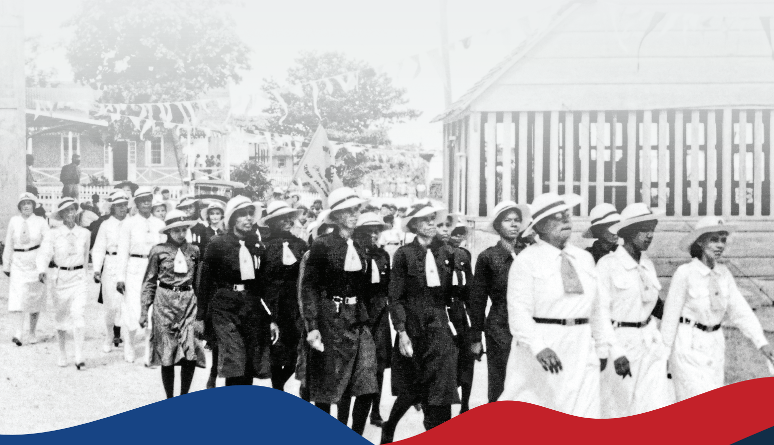
Grand Cayman Girl Guides | 1938